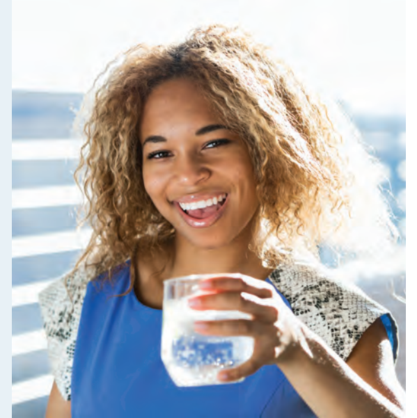
The City of Plymouth strives to provide safe, quality drinking water to residents from a groundwater source: 17 wells ranging from 302 to 473 feet deep that draw water from aquifers.