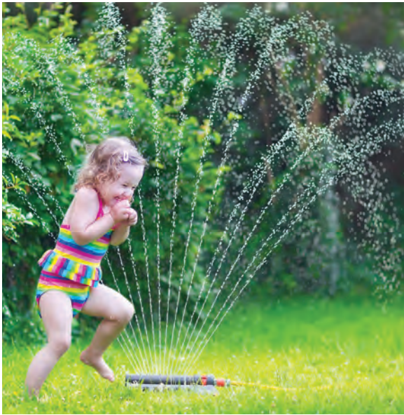
Water conservation need not eliminate summer fun. However, Plymouth residents must comply with the city's water restriction ordinances to help conserve this natural resource.

The restrictions apply to all city water customers. Property owners with automatic irrigation systems must adjust their systems accordingly.