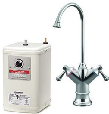
Instant Hot and Cold