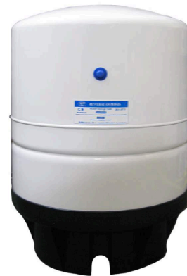
Storage Tank Options