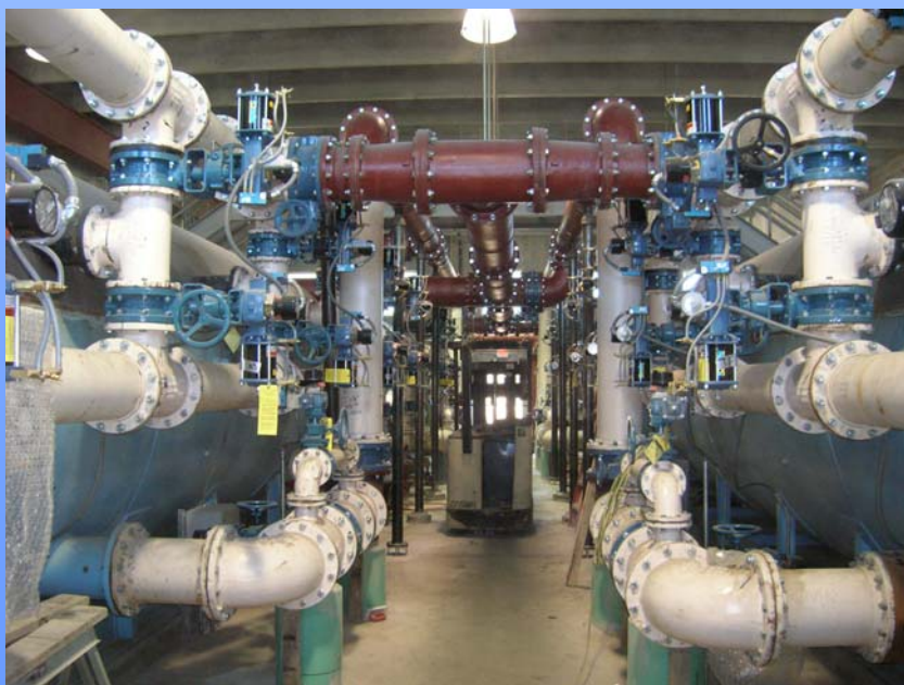
Water Treatment Process Piping, Delano Water Treatment Facility

Some people may be more vulnerable to contaminants in drinking water than the general population. Immuno-compromised persons such as persons with cancer undergoing chemotherapy, persons who have undergone organ transplants, people with HIV/AIDS or other immune system disorders, some elderly, and infants can be particularly at risk from infections. These people should seek advice about drinking water from their health care providers. EPA/CDC guidelines on appropriate means to lessen the risk of infection by Cryptosporidium are available from the Safe Drinking Water Hotline at 1-800-426-4791.