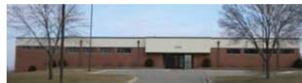
Maple Grove Water Treatment Plant